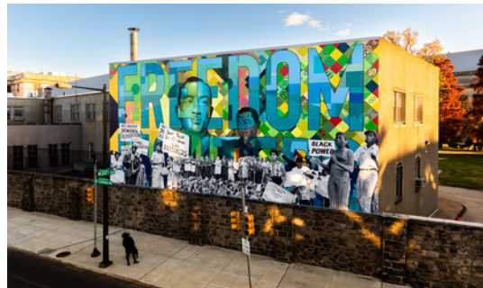
Mural Art Philadelphia

Orillia has the somewhat unique status as both a tourist destination and a bedroom community. It is likely that the "bedroom" element will prevail in the next decade. How do we retain the ambience of our city while embracing this inevitable change to semi-urban status?