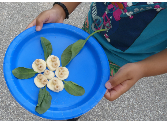
on July 5, 2023

Want to see Summer Nights in your local park in Summer 2024? Let us know!