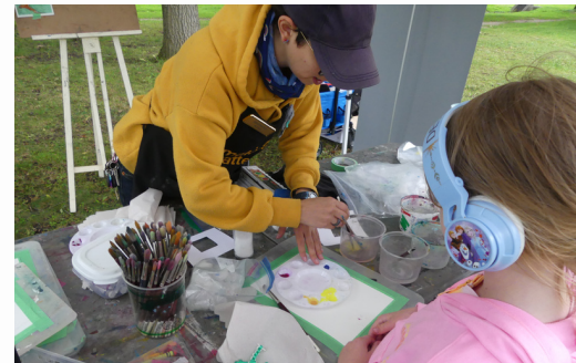
Photo from Children's Outdoor Art on August 30, 2023